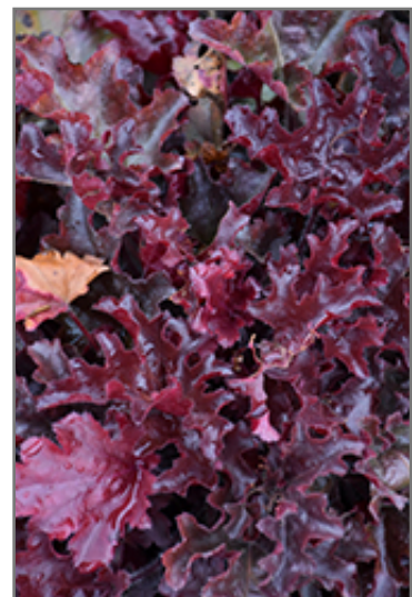
Dolce Cherry Truffles Coral Bells foliage