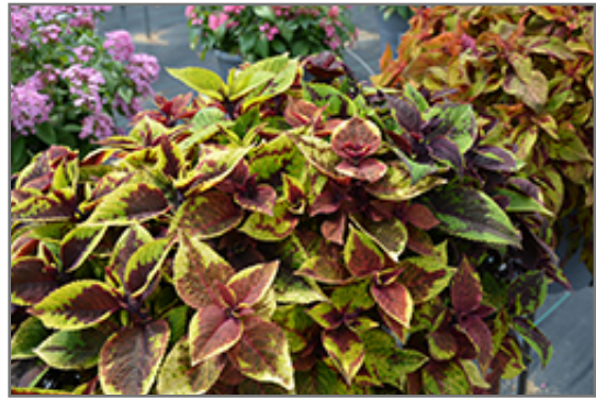
Premium Sun Pineapple Surprise Coleus

Premium Sun Pineapple Surprise Coleus will grow to be about 24 inches tall at maturity, with a spread of 20 inches. When grown in masses or used as a bedding plant, individual plants should be spaced approximately 18 inches apart. Although it's not a true annual, this fast-growing plant can be expected to behave as an annual in our climate if left outdoors over the winter, usually needing replacement the following year. As such, gardeners should take into consideration that it will perform differently than it would in its native habitat.