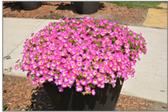
Supertunia Daybreak Charm Petunia in bloom