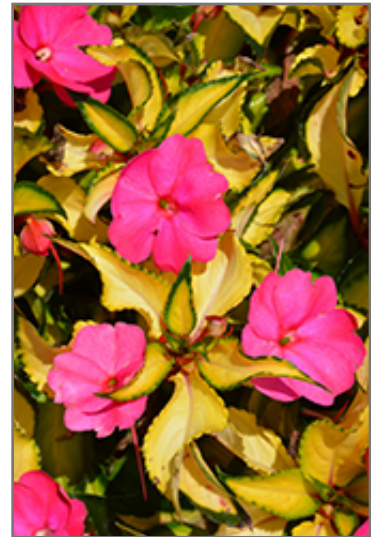
SunPatiens Compact Tropical Rose New Guinea Impatiens flowers

SunPatiens Compact Tropical Rose New Guinea Impatiens is a dense herbaceous annual with a mounded form. Its medium texture blends into the garden, but can always be balanced by a couple of finer or coarser plants for an effective composition.