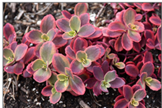
Sunsparkler Wildfire Stonecrop foliage