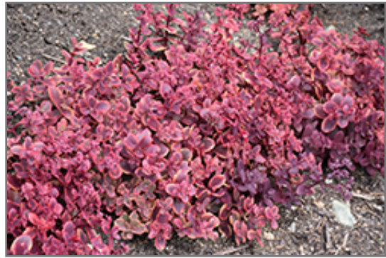
Sunsparkler Wildfire Stonecrop