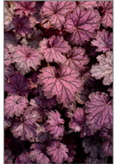
Little Cuties Frost Coral Bells foliage

Little Cuties Frost Coral Bells is recommended for the following landscape applications;