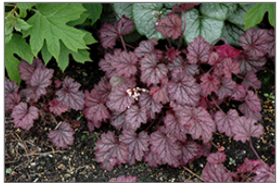
Little Cuties Frost Coral Bells