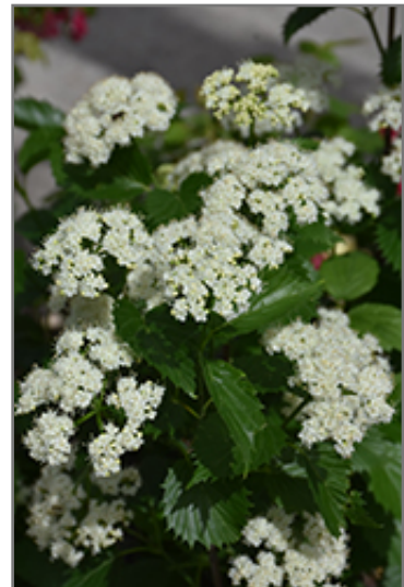
Blue Muffin Viburnum flowers