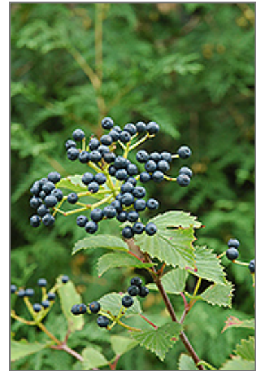
Blue Muffin Viburnum fruit

Blue Muffin Viburnum is recommended for the following landscape applications;