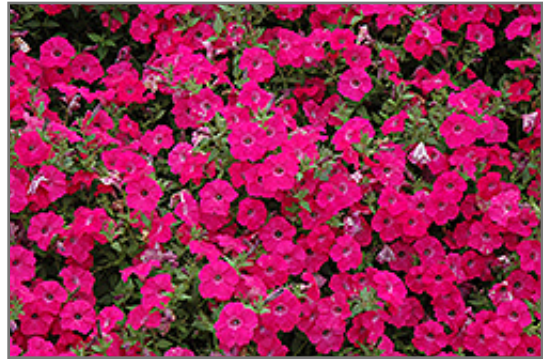
Tidal Wave Hot Pink Petunia in bloom