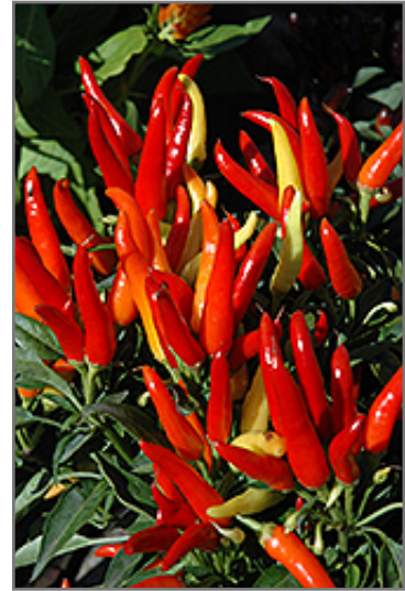
Chilly Chili Ornamental Pepper fruit

Chilly Chili Ornamental Pepper is an herbaceous annual with an upright spreading habit of growth. Its medium texture blends into the garden, but can always be balanced by a couple of finer or coarser plants for an effective composition.